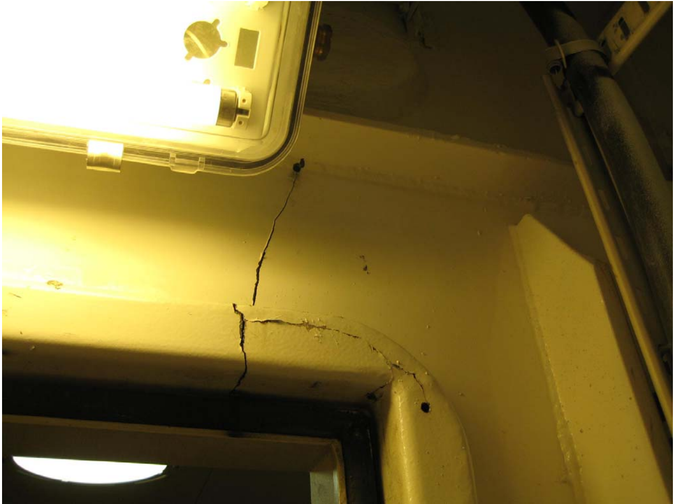
Figure 1: Openings in longitudinal bulkhead – a fracture in way of a door frame